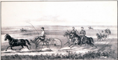
HOW HER MAJESTY'S MAILS WERE CONVEYED FROM TOUCHWOOD TO CLARKE'S CROSSING.