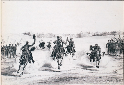
CAMP LIFE AT FORT PITT. [See page 39.]

(From sketches by Mr. F. W. Carron, special artist of the "Illustrated War News" with General Wolstencroft's Expedition.)