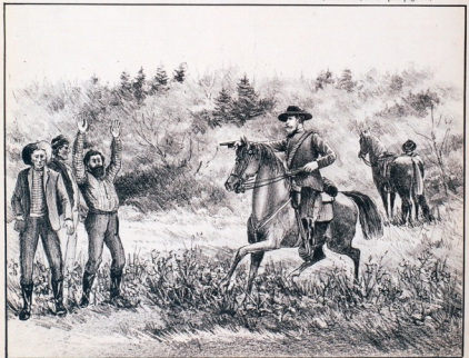
CAPTURE OF LOUIS RIEL BY THE SCOUTS ARMSTRONG AND HOWIE, MAY 16TH, 1885. [See page 39.]