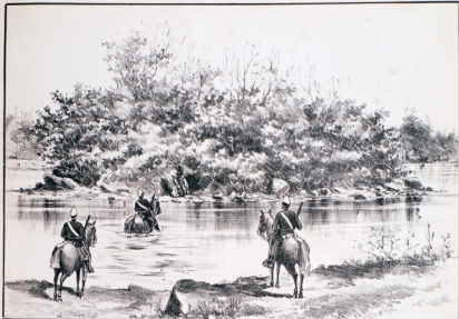
BIG BEAR SURRENDERING TO THE MOUNTED POLICE ON AN ISLAND IN THE SASKATCHEWAN. [See page 50.]