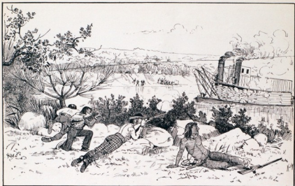
THE STEAMER "NORTHCOTE" RUNNING THE GAUNTLET AT BATOCHÉ, MAY 9TH, 1885. [See page 39.]