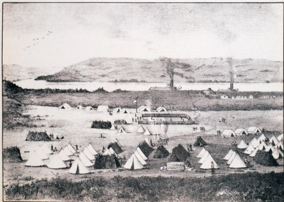
CHURCH PARADE AT FORT PITT, SUNDAY MORNING, JUNE 2nd, 1855. [See page 50.]

(From a sketch by Corporal E. C. Currie, No. 4 Company, 20th Battalion Royal Grenadiers.)